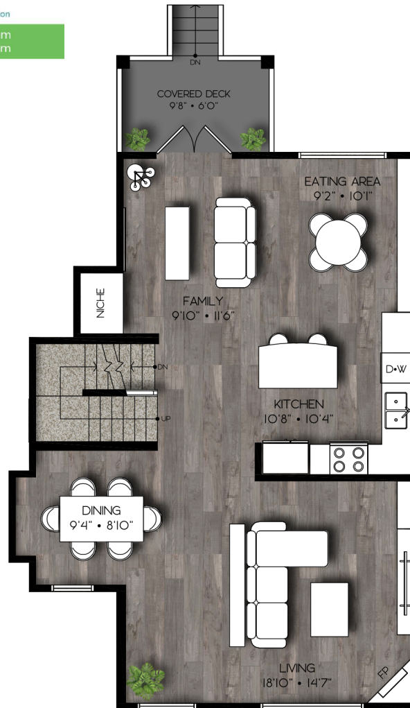
MAIN FLOOR 843 SQFT